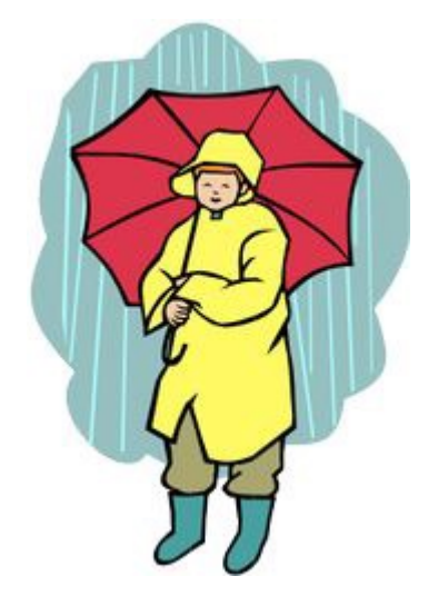
rainy and cold