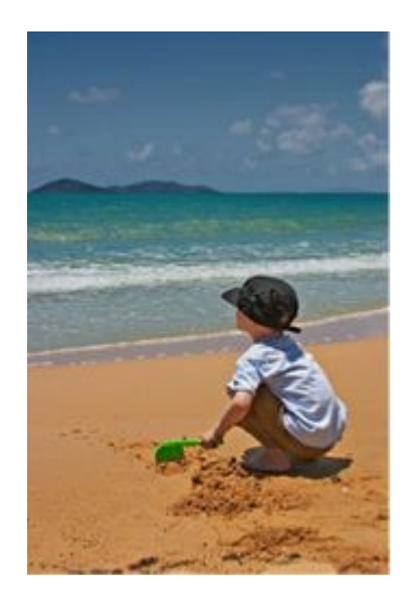
sunny and hot